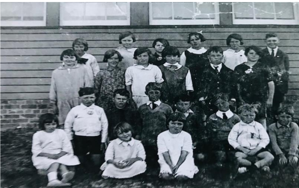
Students at Snug School up Tiers Road. This school was unfortunately burnt down in later years

My mother said classes were often held outside and she loved the bush stories such as "Snugglepot and Cuddlepie". Her own children grew up to have a love of books and several of her grandchildren have now written books of their own.