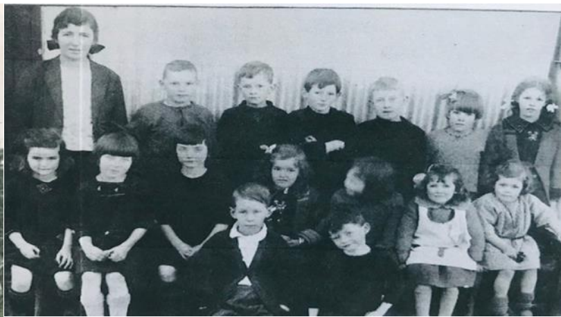
Students from the Electrona Subsidised School

My mother said classes were often held outside and she loved the bush stories such as "Snugglepot and Cuddlepie". Her own children grew up to have a love of books and several of her grandchildren have now written books of their own.