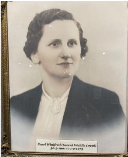
A selection of the wonderful images in the exhibition.